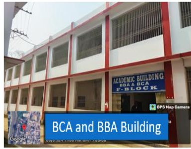
BCA and BBA Building